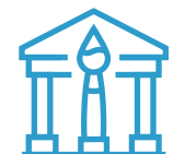
Exhibit Your Artwork (and your Students' Artwork) Nationally

NAEA Collaborate is our online community available only for members. Have a question ranging from classroom management to research? Want to share an idea or gain some inspiration? You have a network of thousands of visual arts educators—anytime, anywhere—at your fingertips.