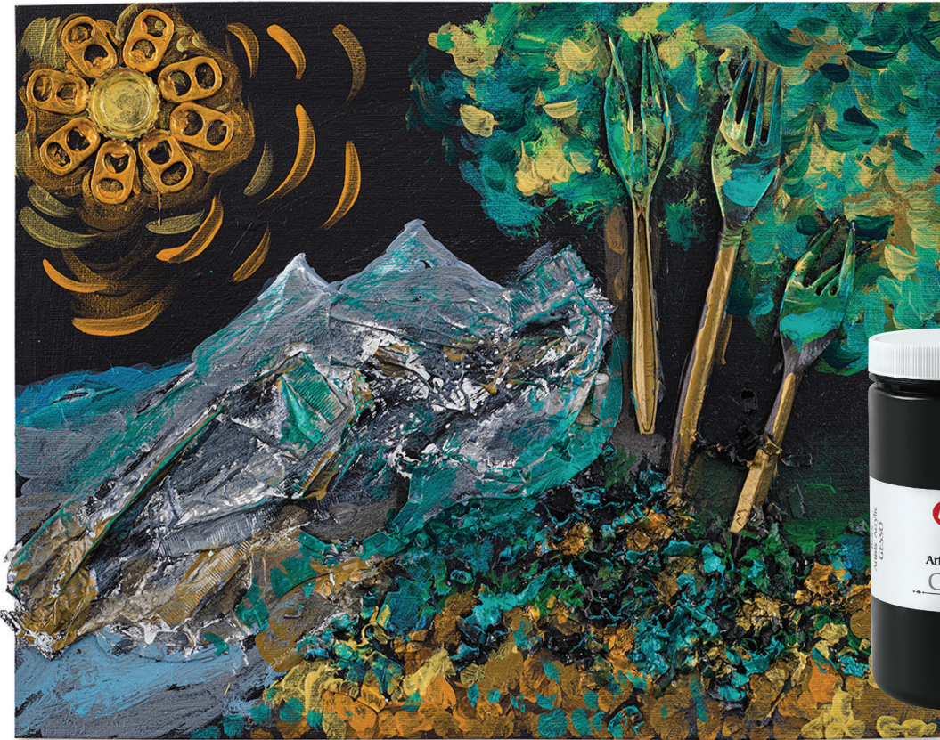
Utrecht Black Artists' Acrylic Gesso Item #02030-1007